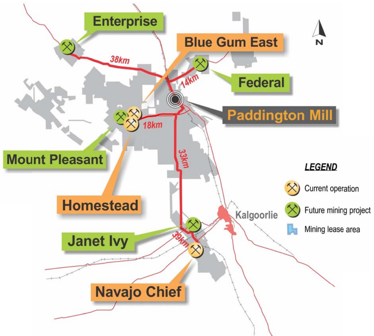
Paddington Operations location map: Paddington mine sites and haul distances to the plant.

Background: Paddington has conventional open cut and underground mining operations and a carbon-in-leach (CIL) processing operation with capacity to process 3.3Mt of ore annually. Located 35km north of Kalgoorlie, the Paddington Mill operates 24 hours a day, 365 days a year. Most staff live in Kalgoorlie, a major regional centre and excellent support hub for mining in the Goldfields.