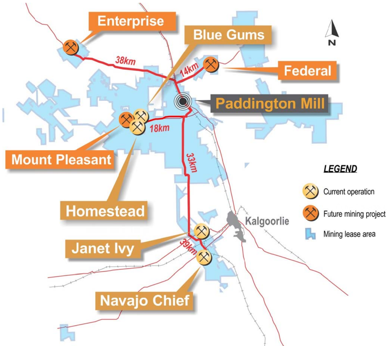
Paddington Operations location map: Paddington mine sites and haul distances to the plant.

Background: Paddington has conventional open cut and underground mining operations and a carbon-in-leach (CIL) processing operation with capacity to process 3.3Mt of ore annually. Located 35km north of Kalgoorlie, the Paddington Mill operates 24 hours a day, 365 days a year. Most staff live in Kalgoorlie, a major regional centre and excellent support hub for mining in the Goldfields.